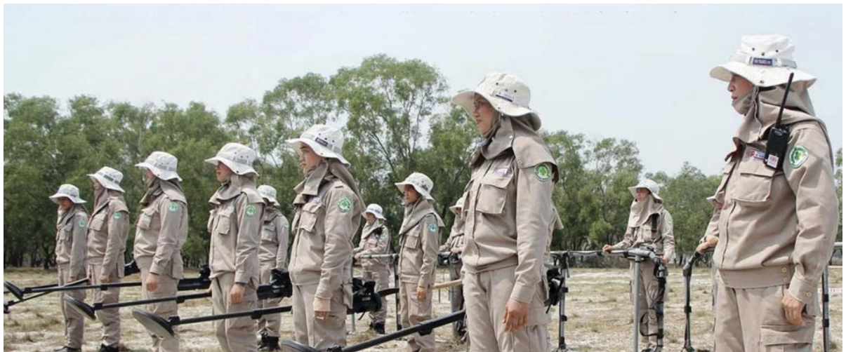
BOTTOM: RENEW's all-women bomb clearance team