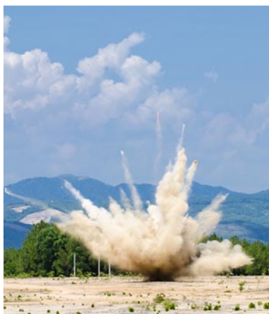
Quang Tri Province, Vietnam – A controlled demolition conducted by a Project RENEW team.

To attend either in-person or remotely, please email: InfoRENEW@RENEWvn.org